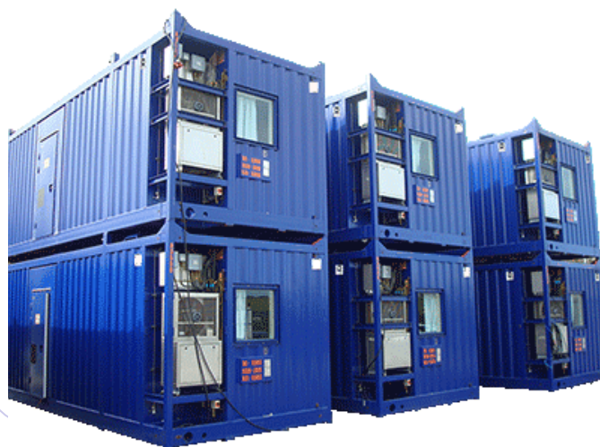
Offshore Accommodation Complex