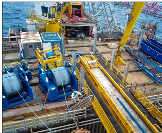
Spooling units simultaneously deploying ESP, Chemical Injection, Gauge and SV - Norwegian Continental Shelf (2021)

We can supply standard spooling units on a rental basis and also bespoke units designed to meet customer requirements.