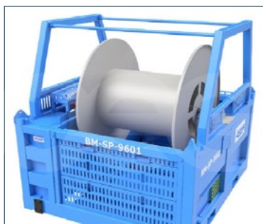
96" Spooler Unit