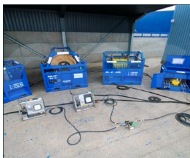
Spooler Air Pig Set up