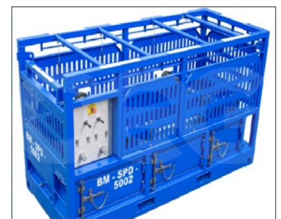
Dual Spooler Unit