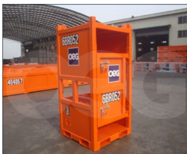
6 Bottle Rack