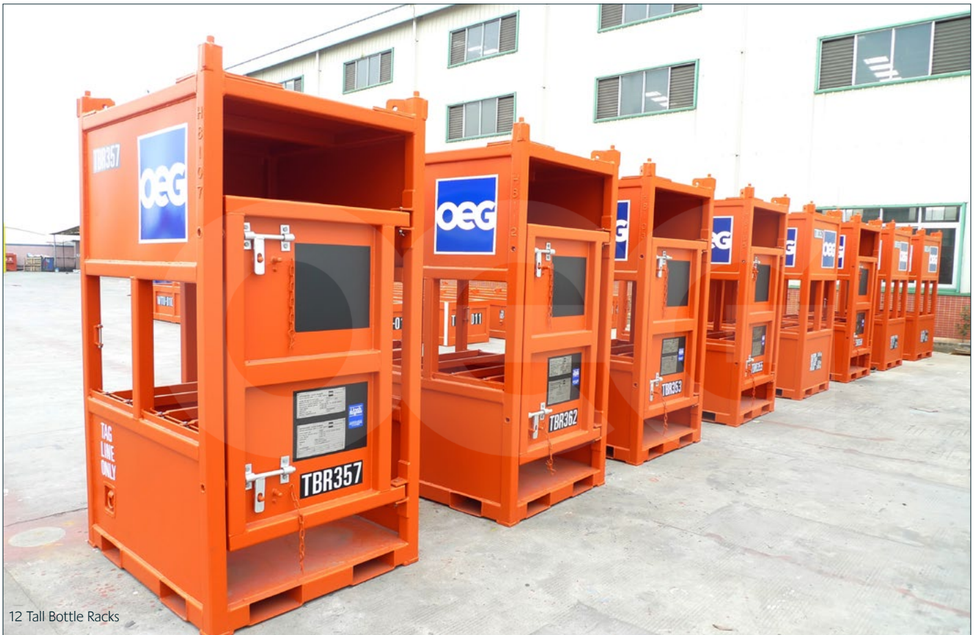
12 Tall Bottle Racks

DNV 2.7-1 / EN 12079 or ISO 10855, SEPCo, API, DOT, CFR, ASME VIII DIV 1., IMDG, ADR/RID & UK CAA CAP 43.