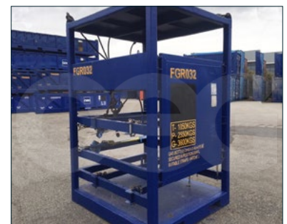
25 Bottle Rack