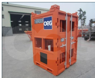
16 Bottle Rack