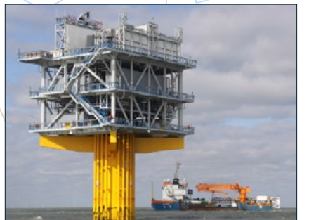
Yard & offshore assistance with installation and commissioning

First Choice in Cargo-Carrying Units, Transportable Tanks, A60 Cabins and associated services worldwide for Sale and Rental