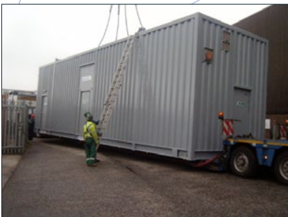
Load out of the modules from the UK to Belgium topsides Fab yard