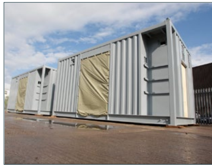
Modules fully painted to offshore specification and ready for outfitting