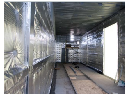
Initial outfitting of modules