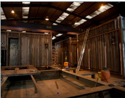
Fabrication of modules