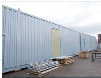
Modules positioned for equipment integration