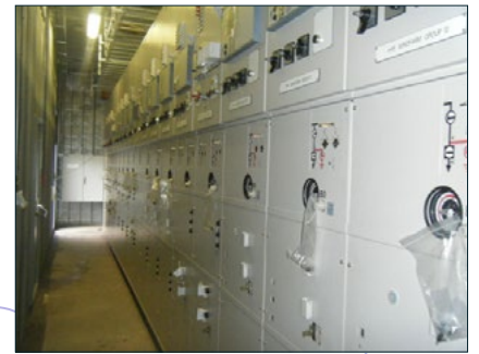
Electrical & instrumentation integration complete