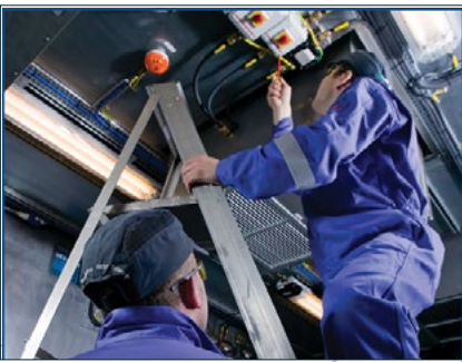
Outfitting work progressing