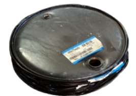
Example of crushed drum to 4.5" height (MPC60)

Note: All measurements are rounded up to the nearest whole unit or decimal.