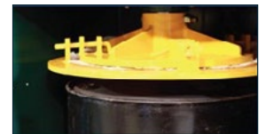
Ram extension installed to crush drums (MPC60 or 85)