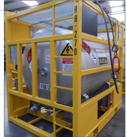
Horizontal Jet A-1 Fuel Tanks

Approvals: ADR/RID, DNV 2.7-1 / EN 12079, IMDG, ASME.VIII-1, PED and CAP 437 compliant.