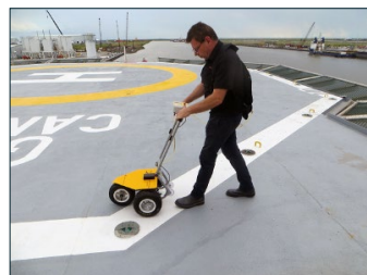
Helideck Surface Friction Testing