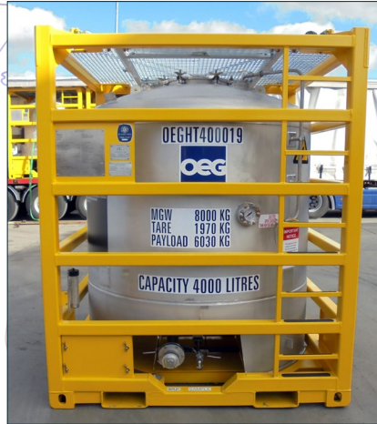
Vertical Jet A-1 Fuel Tanks