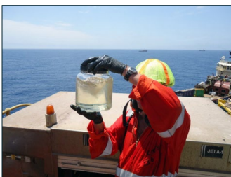
Helicopter Refuelling System Inspection