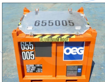
*Waste Skip with lid