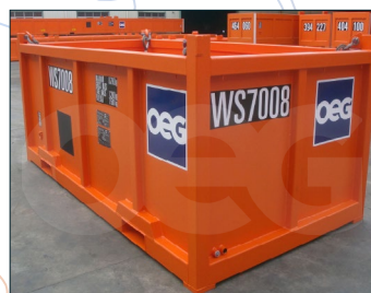
*7m³ Waste Skip