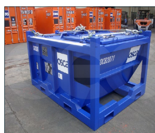
7.5T (17bbl) Small Drill Cutting Box (SDCB)