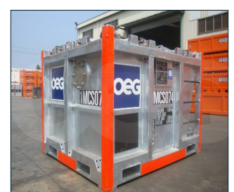
11T (24bbl) Mud Skip