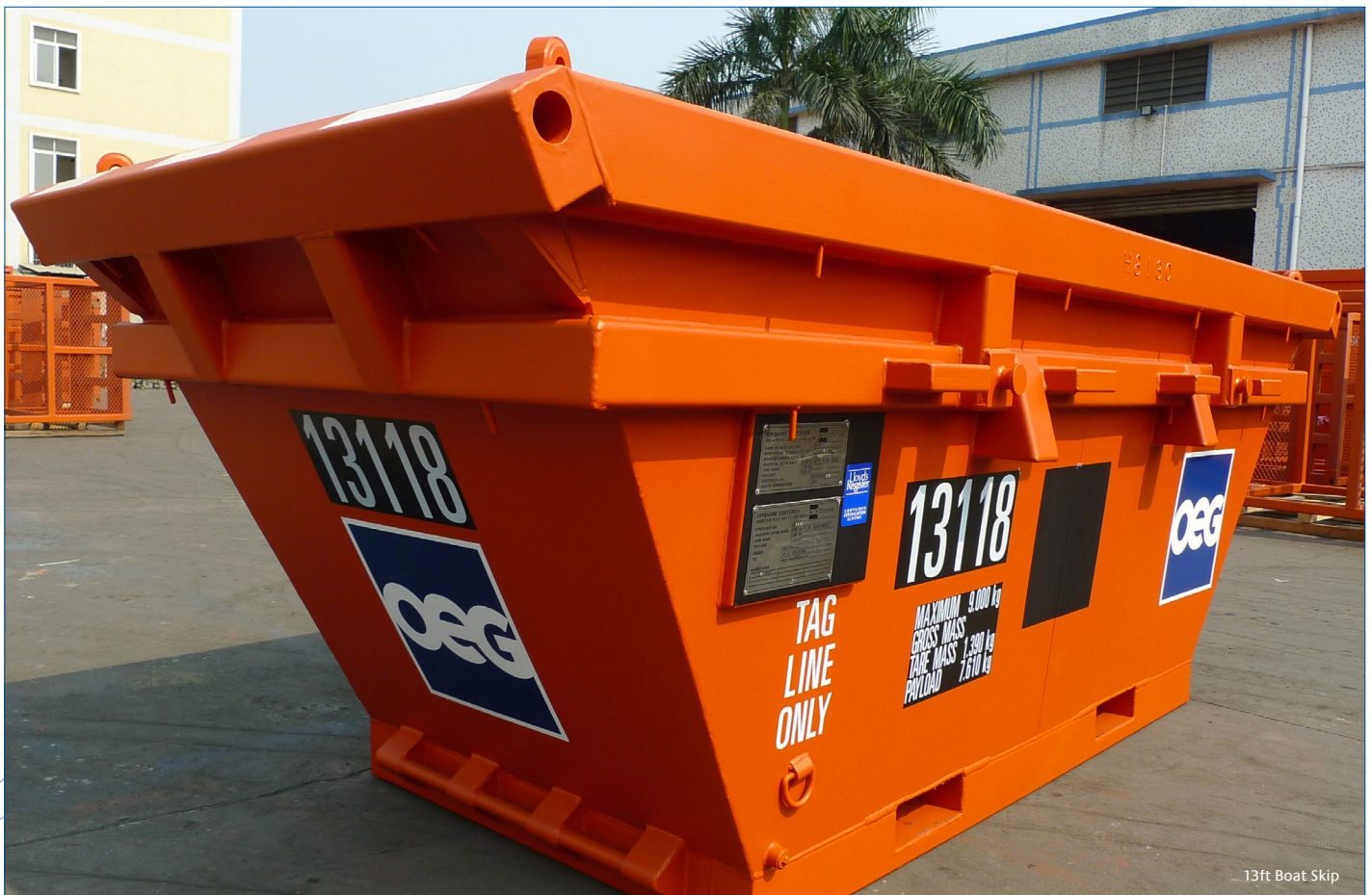
13ft Boat Skip

For rates and availability please e-mail: sales@oegoffshore.com