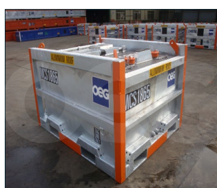
6T (16.5bbl) Mud Skip