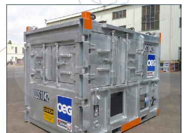
*8m³ Quick Discharge Waste Bin

*DNV 2.7-1 certified unit designs available as build for sale / bespoke design options