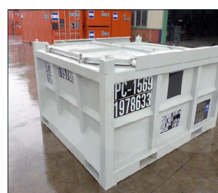
*10T (22bbl) Low Profile Mud Skip