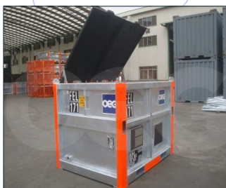
*Front End Loading (FEL) Skip